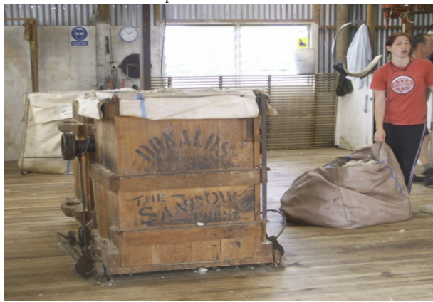
Figure 2. Woolpress.