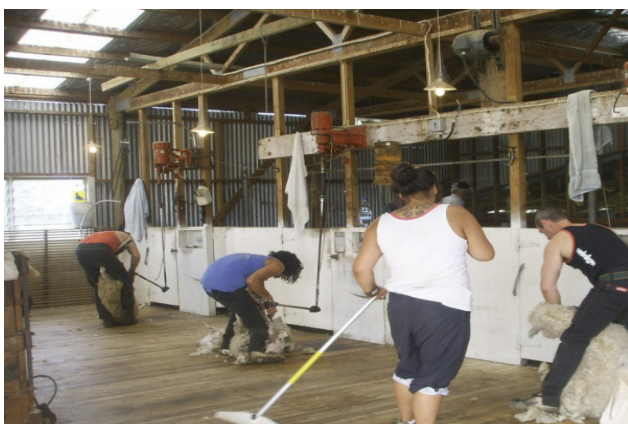
Figure 1. Shearers and sorters.

Maintenance of the plant and the acoustic environment of the shed would also reduce exposure and are the responsibility of the farm owner or operator. Proper maintenance of the gear could be insisted upon, but the expense of acoustically treating sheds which are in use for a matter of weeks (or days) in the year might be more problematic.